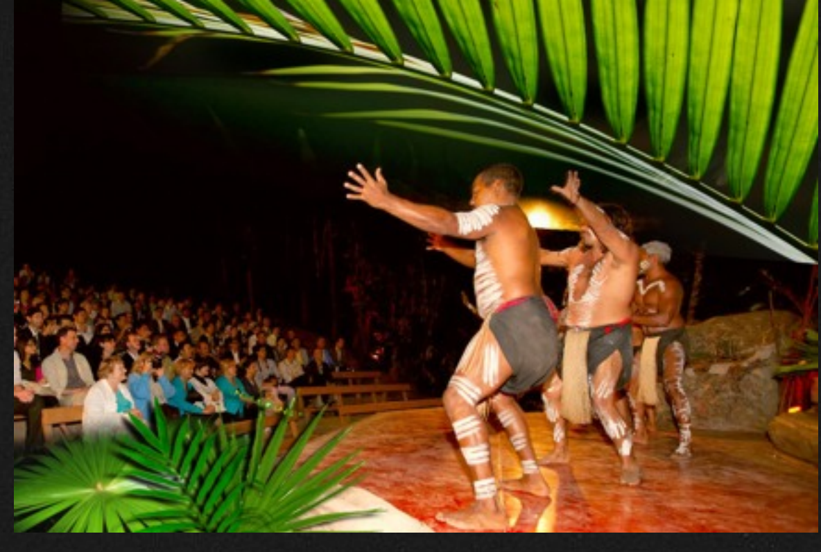
Pamagirri Night Show

Welcome your guests with a traditional Aboriginal welcome. A solo performer with a didgeridoo or several performers with clapsticks to accompany the didgeridoo player